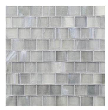
Gullwing Silk SHO-1-3/4X2-GULLWING-SLK