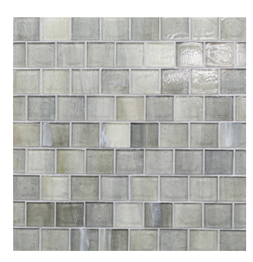
Gullwing Pearl SHO-1-3/4X2-GULLWING-PRL