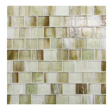
Moss Pearl SHO-1-3/4X2-MOSS-PRL