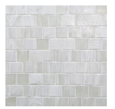
Foam Pearl SHO-1-3/4X2-FOAM-PRL