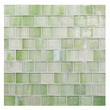
Palm Pearl SHO-1-3/4X2-PALM-PRL