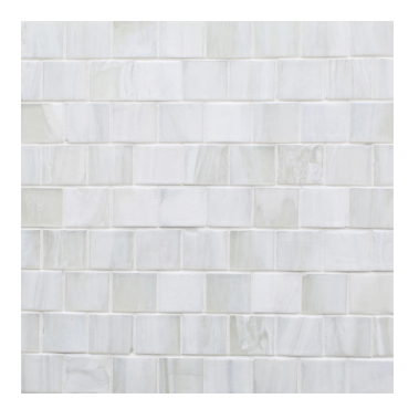
Foam Silk SHO-1-3/4X2-FOAM-SLK