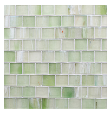
Palm Silk SHO-1-3/4X2-PALM-SLK