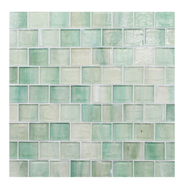
Aruba Pearl SHO-1-3/4X2-ARUBA-PRL

Mosaic are mounted paper faced. All sizes noted are nominal.