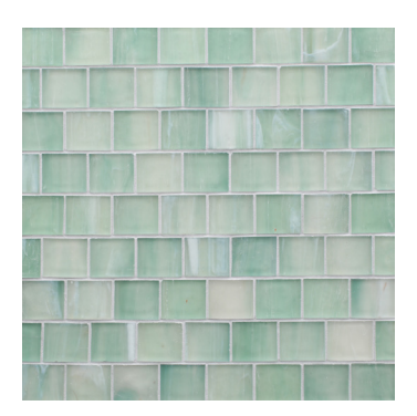
Aruba Silk SHO-1-3/4X2-ARUBA-SLK

Mosaic are mounted paper faced. All sizes noted are nominal.