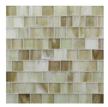
Moss Silk SHO-1-3/4X2-MOSS-SLK