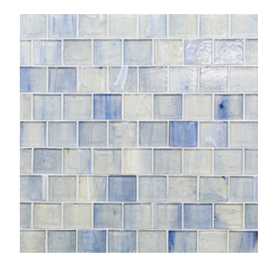
Cayman Pearl SHO-1-3/4X2-CAYMAN-PRL