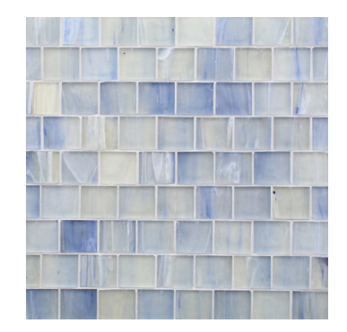
Cayman Silk SHO-1-3/4X2-CAYMAN-SLK