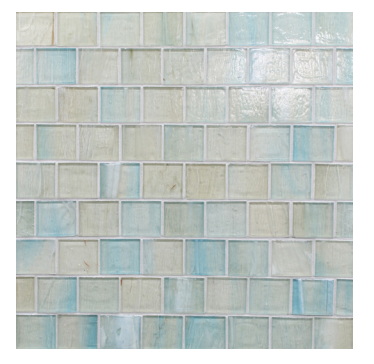
Bahama Pearl SHO-1-3/4X2-BAHAMA-PRL