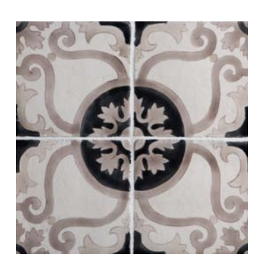
Lisbon Cinza Antique Matte Crackle MAJ-6X6-LISBOCIN-AMC