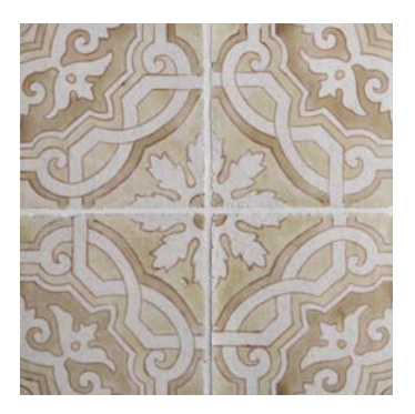
Amalfi Verde Antique Matte Crackle MAJ-6X6-AMALFVER-AMC