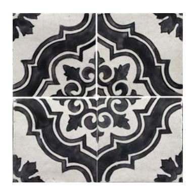
Alcazar Tinta Antique Matte Crackle MAJ-6X6-ALCAZTI-AMC