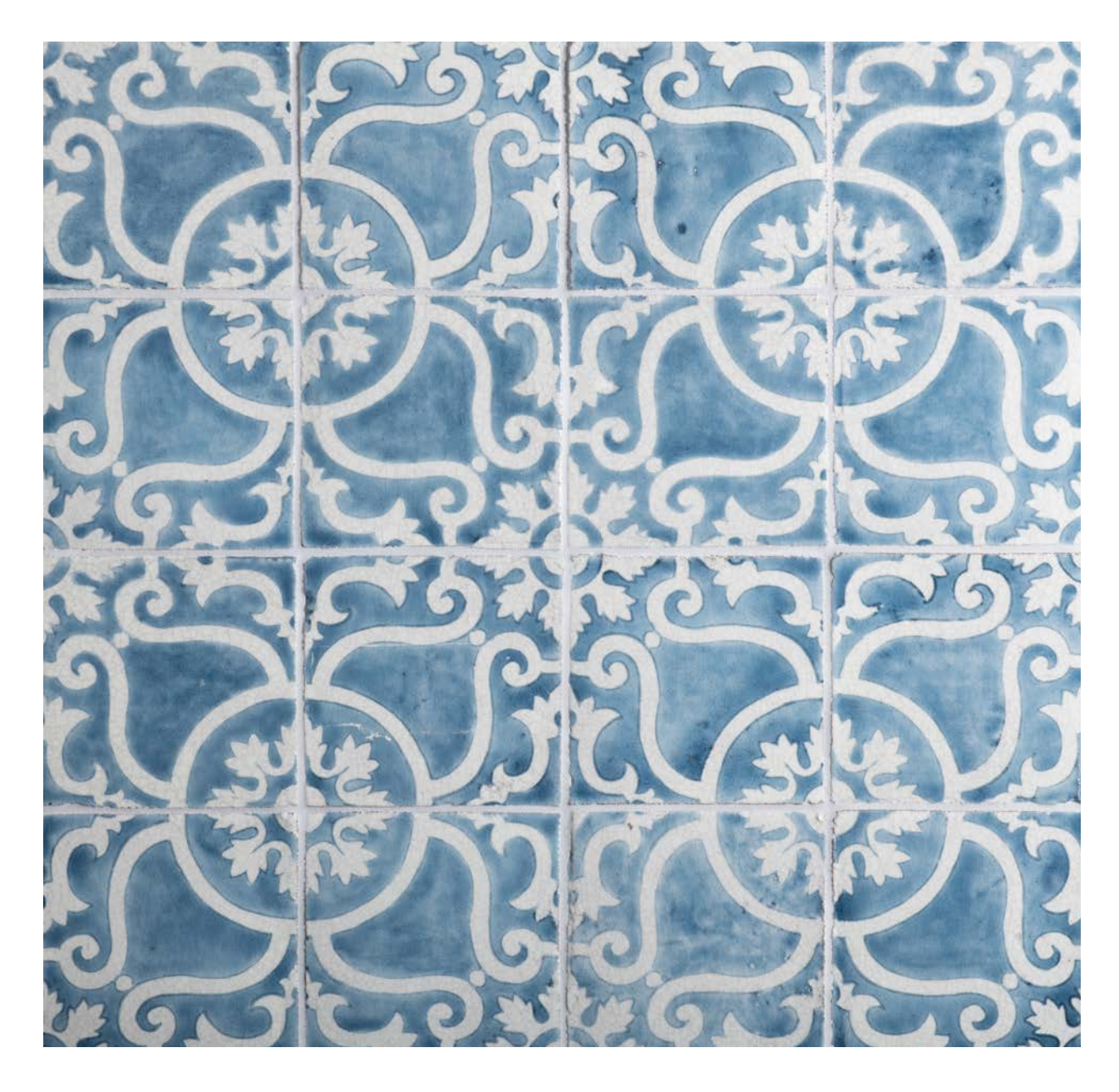
All sizes noted are nominal.