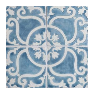
Lisbon Atlantica Antique Gloss Crackle MAJ-6X6-LISBOATL-AGC