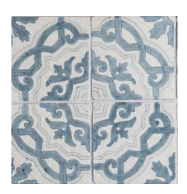
Amalfi Azul Antique Gloss Crackle MAJ-6X6-AMALFAZU-AGC