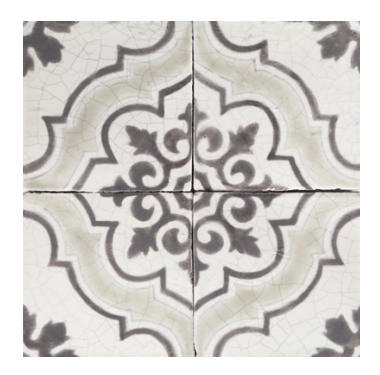
Alcazar Cinza Antique Matte Crackle MAJ-6X6-ALCAZCI-AMC